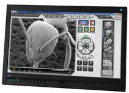
*Tilt/rotation motor drive holder included

• Resolution and Analytical Performance: